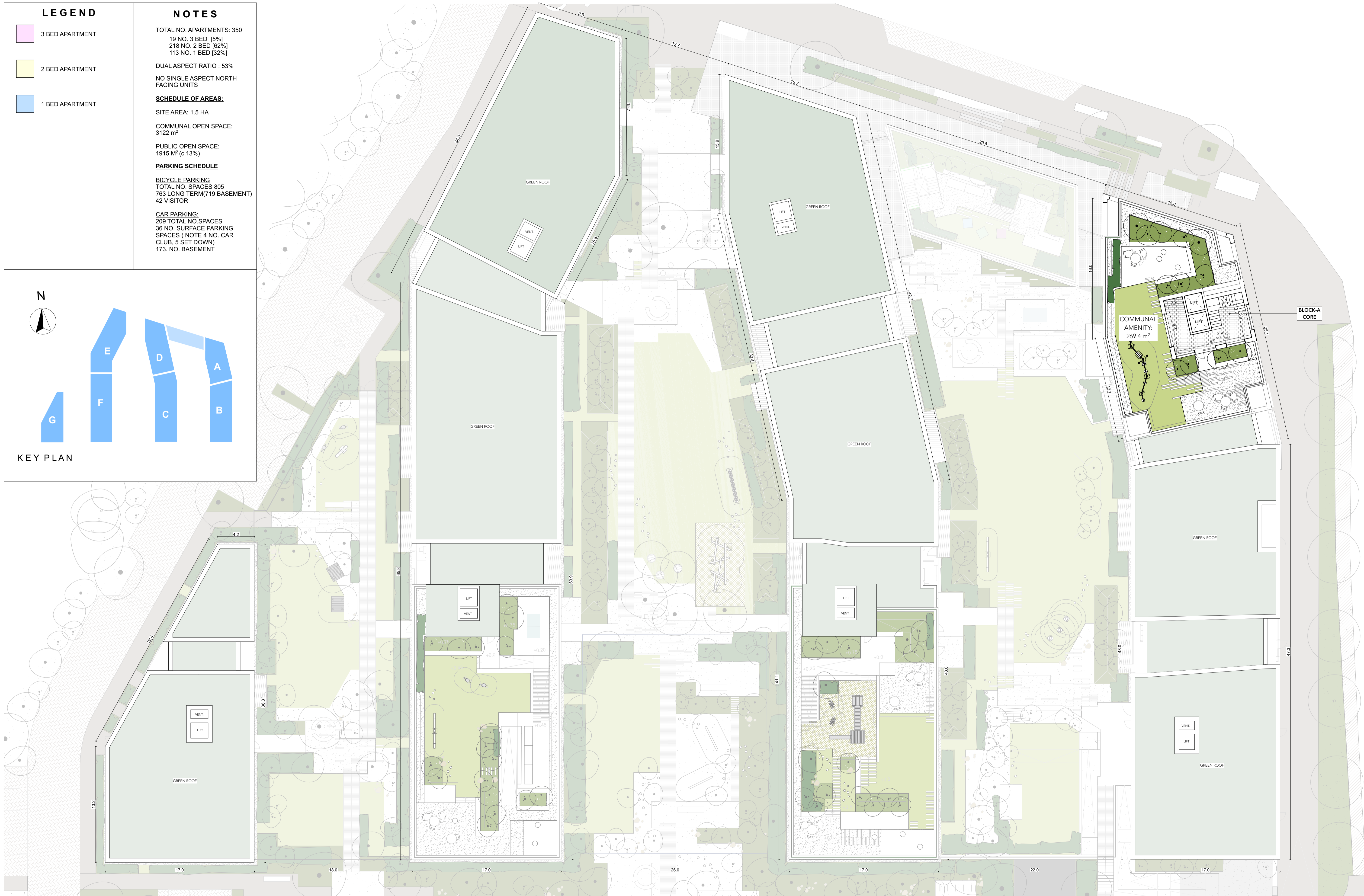
Fourteenth Floor Plan SCALE : 1:200